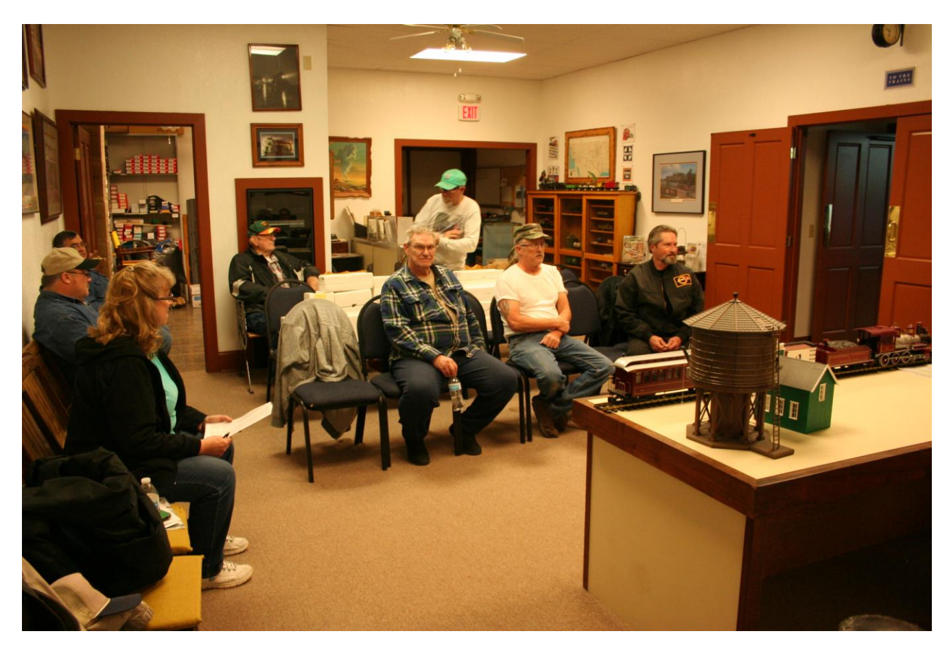
Nov. 14, 2019: Members present for a brief pow-wow.