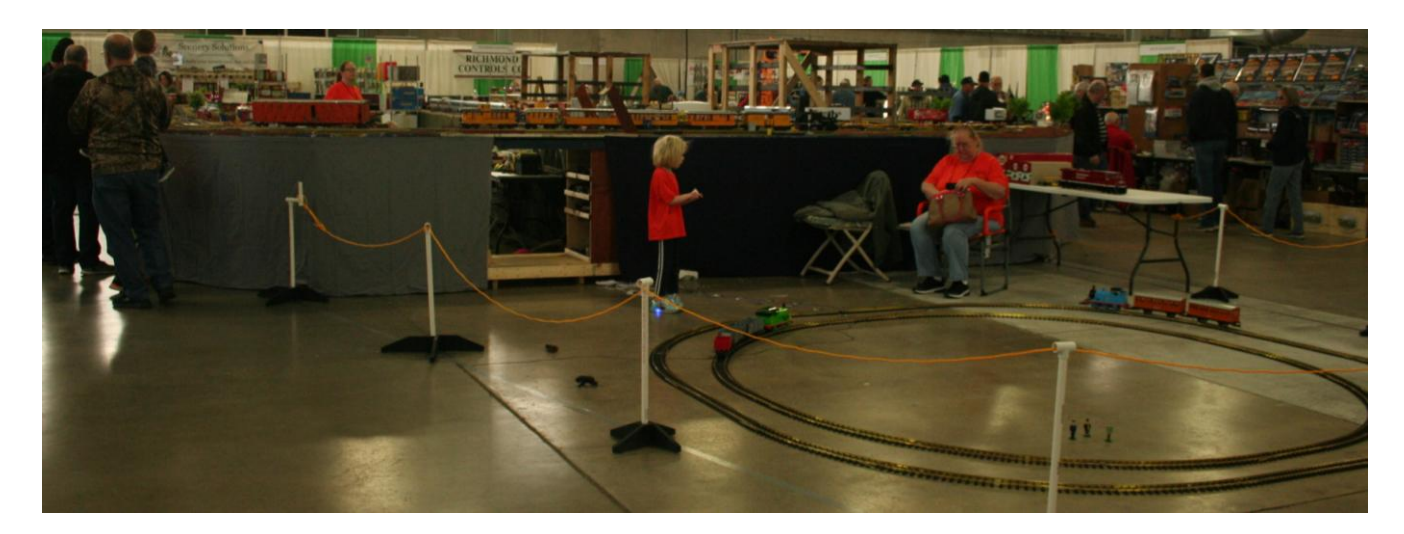
G-scale: Thomas the Tank Engine & friends on the floor with the Rio Grande on modular layout in background.