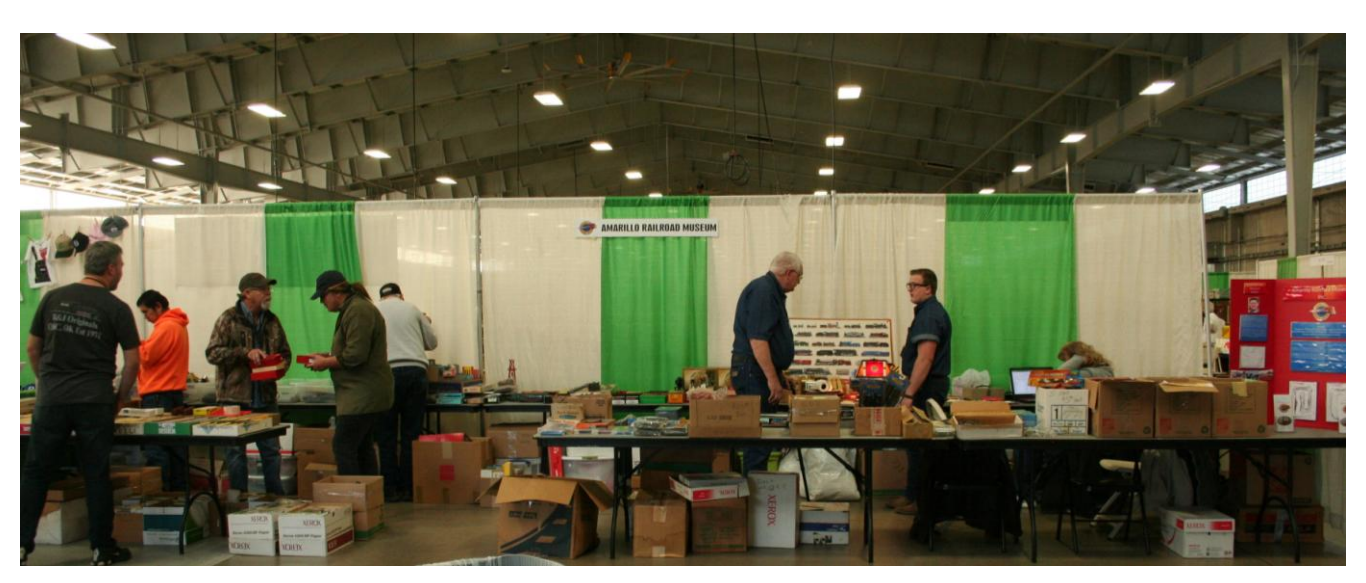
ARM Booth before show opened Saturday morning; other vendors shopping while we were setting-up.