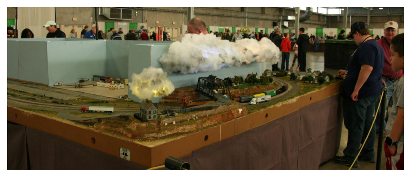
Storm clouds with lightning on an HO scale layout.