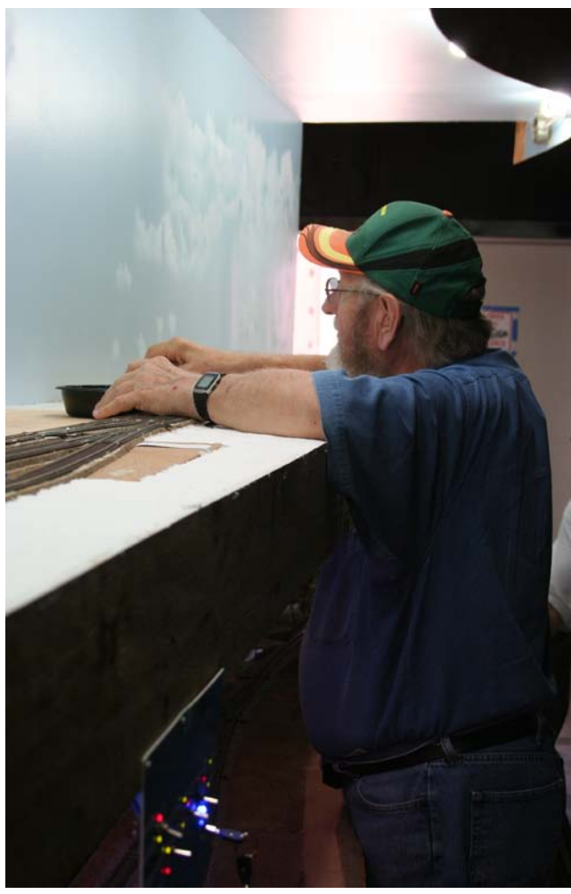
July 11, 2020: Above Left: Air is assisting with clean-up of the layout at Miami. Above Right: Virgil applies Sculpt-amold scenery base at Texico. Below: Still July 11, this former Rock Island hopper was observed in a mixed train passing by the ARM 40-years after the Rock Island ceased operations.