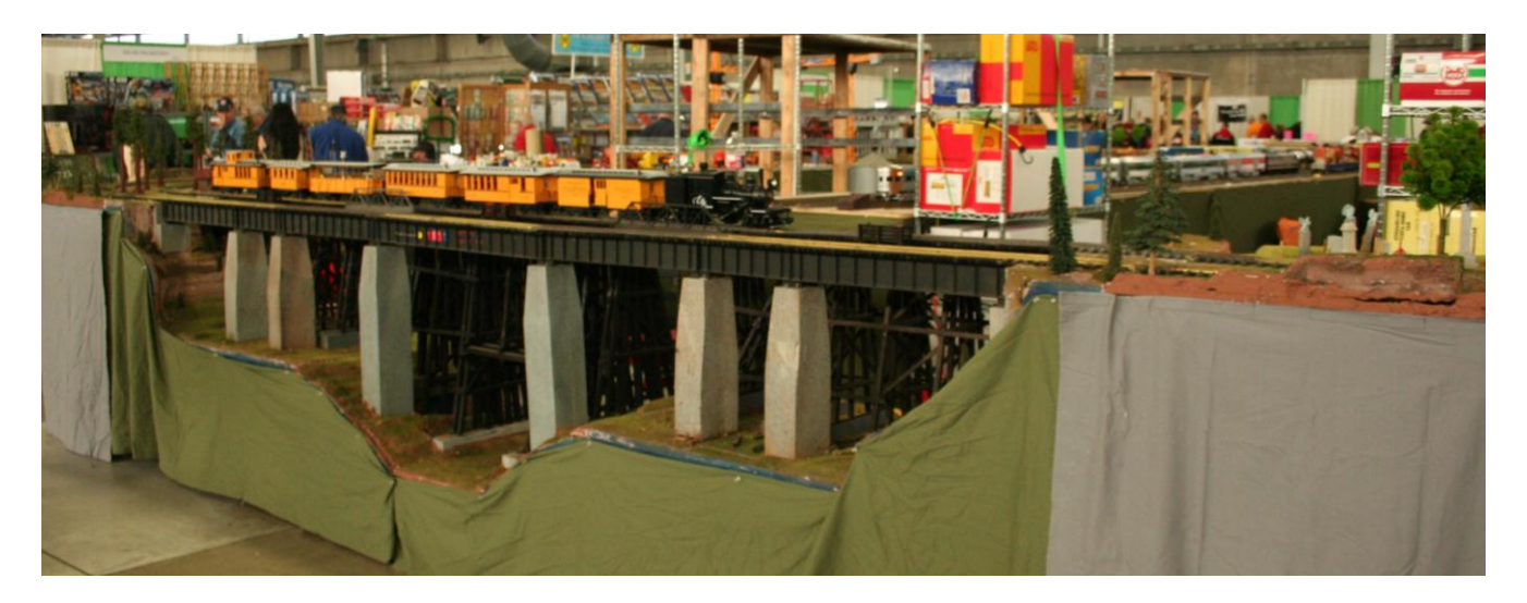
Another view of the G-scale Rio Grande modular layout.