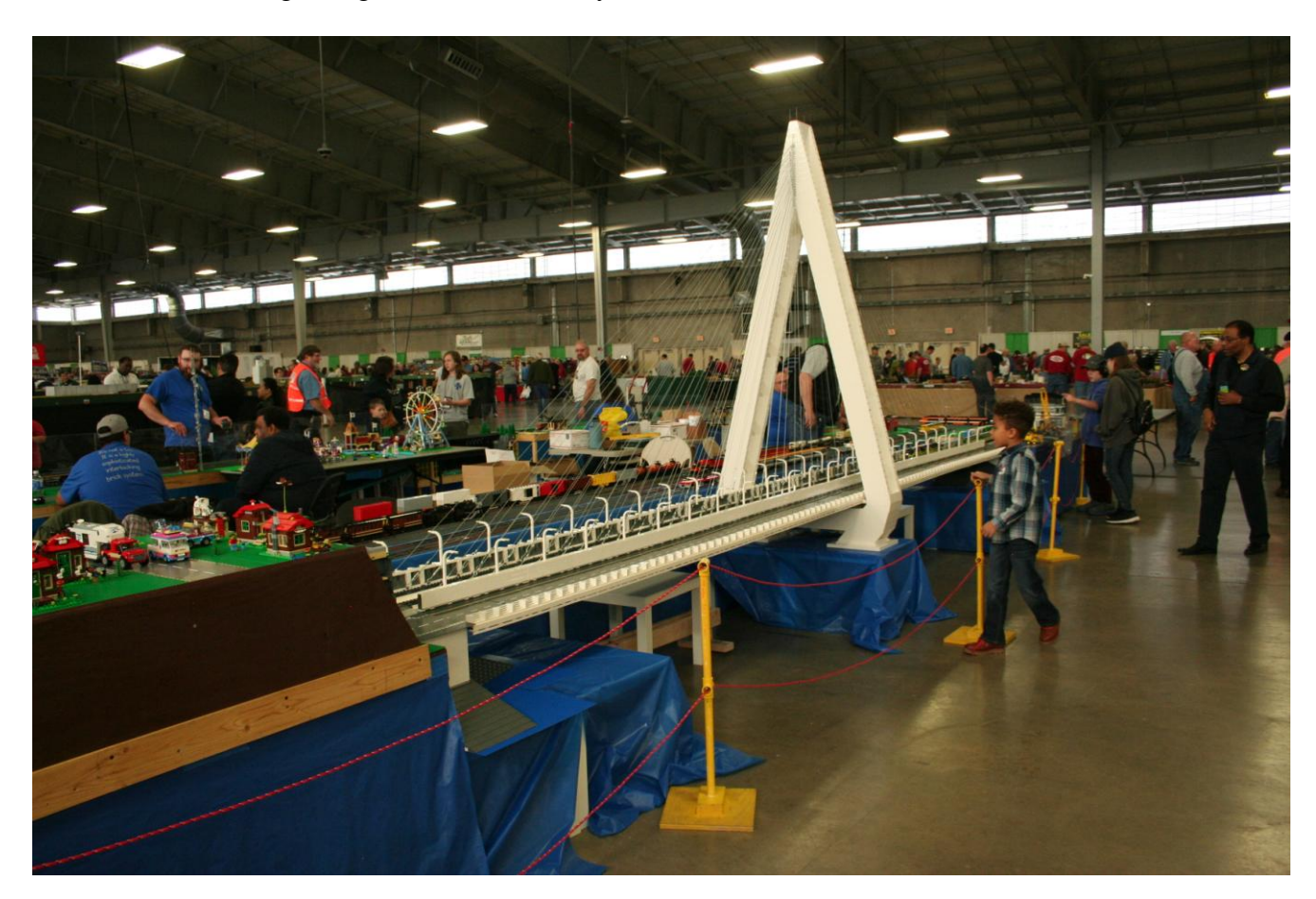
LEGO layout with LEGO cable-stayed bridge.